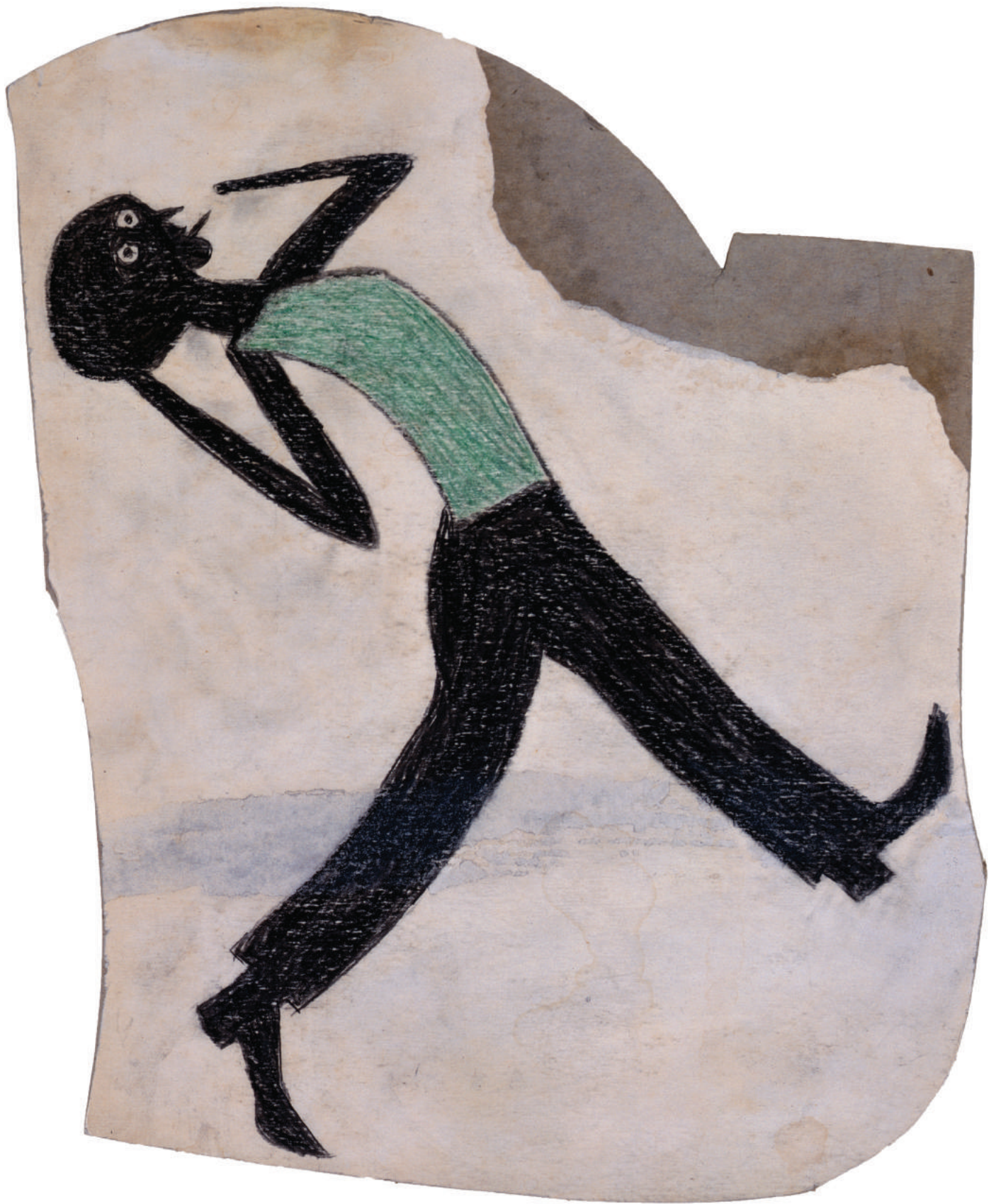
Bill Traylor (c. 1854–1949), Untitled (Bent Man Smoking) , 1939–42, Conté crayon and coloured pencil on cardboard, 15.5 x 12.5 ins. / 39.4 x 31.8 cm, Louis-Dreyfus Family Collection

ethnologist Pascale Galipeau, with the goals of leading projects towards the recognition for this material in Canada, initiating scholarship, discovering new artists and building an archive.