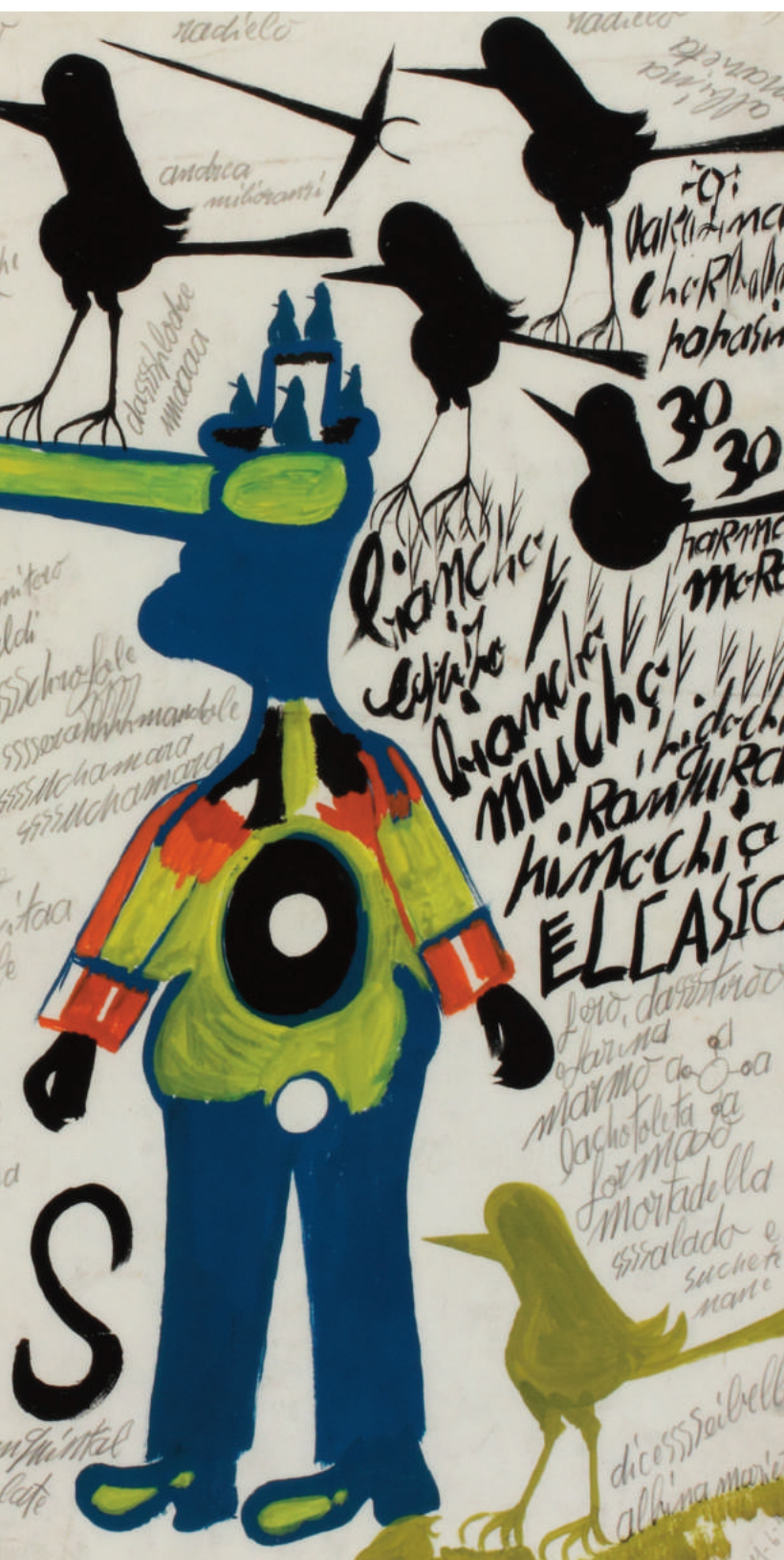
Carlo Zinelli (1916–1974), Untitled (double-sided), San Giacomo Hospital, Verona, Italy, 1970, gouache on paper, 19 x 27.5 ins. / 48.3 x 69.9 cm, collection of Robert A. Roth